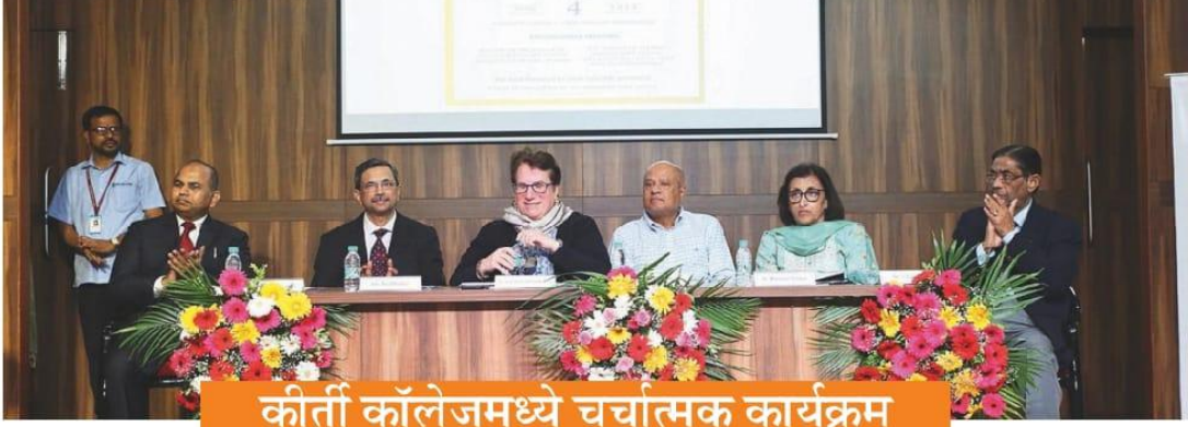
कीर्ती कॉलेजमध्ये चर्चात्मक कार्यक्रम