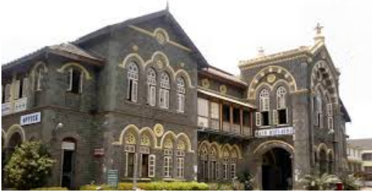
DES's Fergusson College, Pune

The Deccan Education Society (DES), Pune is one of the oldest and renowned educational societies in India, with over 141 years of dedicated service to the nation in the field of education. DES was founded in 1884 by eminent national personalities like Lokmanya Tilak and Gopal Ganesh Agarkar. The DES at present has 60 educational institutions from pre- primary stage to post graduation and research levels in Arts, Science, Commerce, Management, Nursing, Physiotherapy etc. Our alumni include intellectuals, industrialists, politicians, defense personnels, litterateurs and sports persons of highest caliber who have rendered valuable services to the Nation.