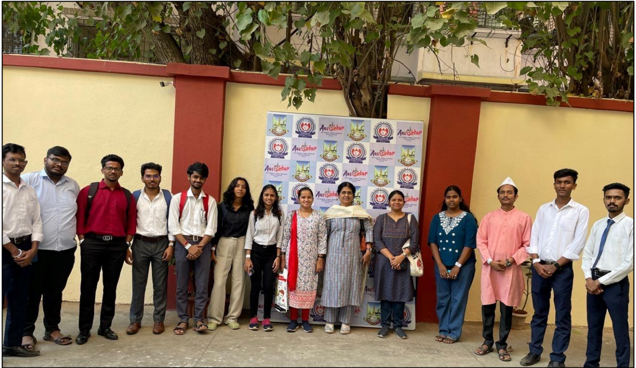
Photo:Students participated in 19 th Aavishkar Research Convention- 2024